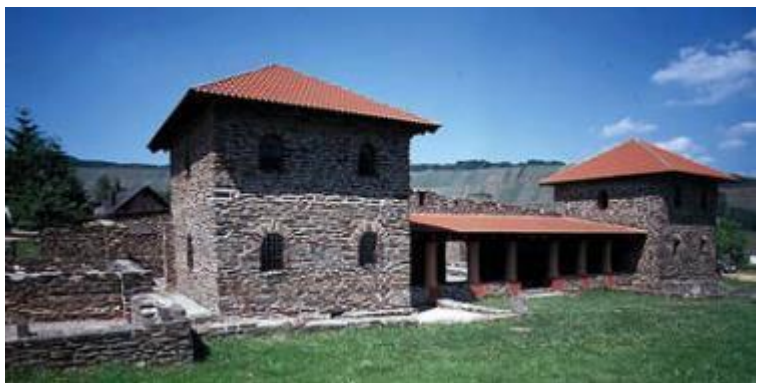
Roman Villa, Mehring