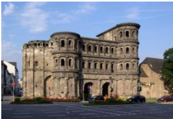
Porta Nigra, Trier

Along today's route you will find a lot of Roman villas and public baths but also relics of other ancient civilizations as the Celts. All those historical buildings are placed on the slopes along the ever winding river. 'Special by the day' is the 'Piesporter Goldtröpfchen', a lovely local blended white wine that we are going to taste in a local wine-bar. The visit to the town of Neumagen-Dhron is interesting for its many Roman remains. This used to be an old Roman fortress and the place where the famous Roman wine ship was found. We spend the night at a mooring place near Trier.