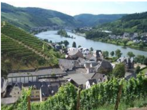
Zell am Mosel

The day starts with a ride to the almost vertical vineyards of Calmont near Bremm. Here you can take a hike up the slopes and see yet another wonderful bend in the Mosel river. After lunch we ride on to the beautiful village of Beilstein, décor of many movies. After the visit we cycle the last part of the trip along the Mosel to Cochem, the final destination of this cycling week. Cochem is famous for its wines and dominated by the old Reichsburg.