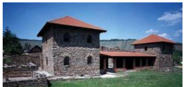
Roman Villa, Mehring